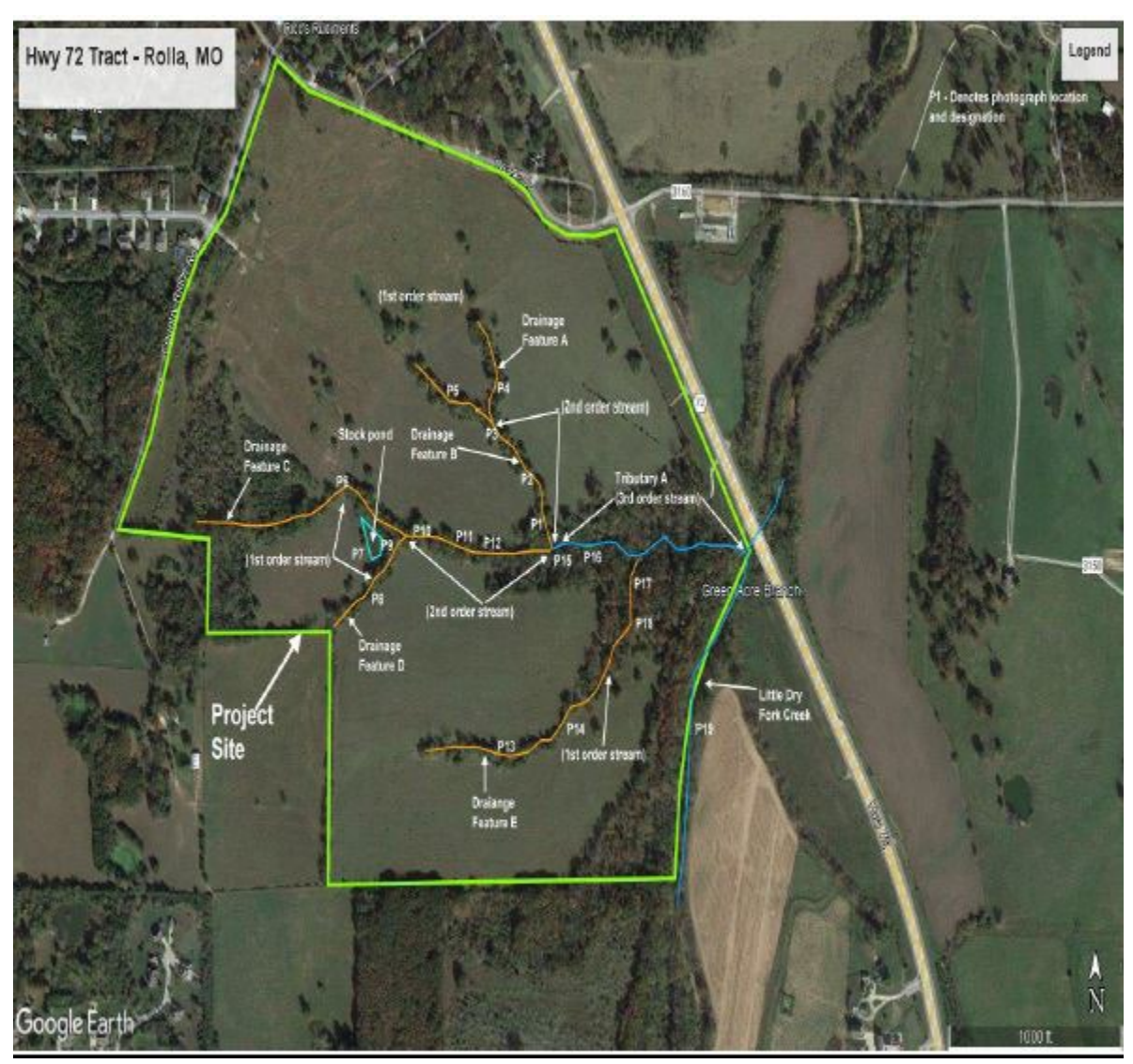
Figure 1 - Resource Map

SUBJECT: Pre-2015 Regulatory Regime Approved Jurisdictional Determination in Light of Sackett v. EPA , 143 S. Ct. 1322 (2023), MVS-2024-369